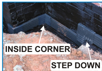
INSIDE CORNER STEP DOWN