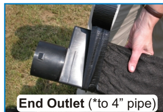
End Outlet (*to 4" pipe)

Tape fittings with J-Tape . *Note: Attach & tape 4" pipe to end/side outlet fitting to carry water to sump pump or daylight.