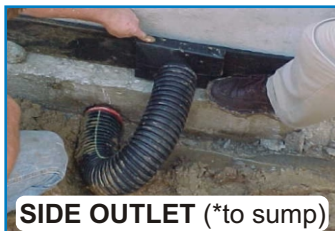
SIDE OUTLET (*to sump)